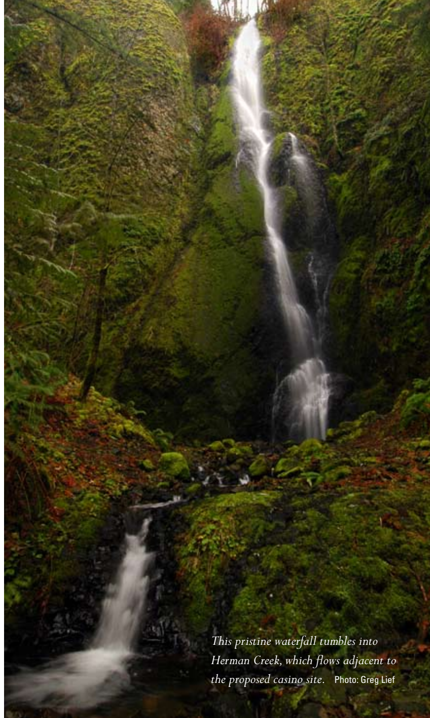
This pristine waterfall tumbles into Herman Creek, which flows adjacent to the proposed casino site.

For Conservation News and Updates, log on to www.gorgefriends.org .