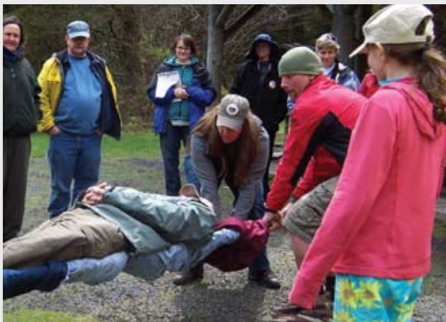
Hike volunteers practice first aid techniques at a Friends training.