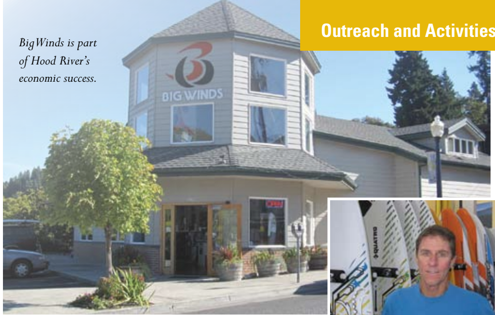
BigWinds is part of Hood River's economic success.