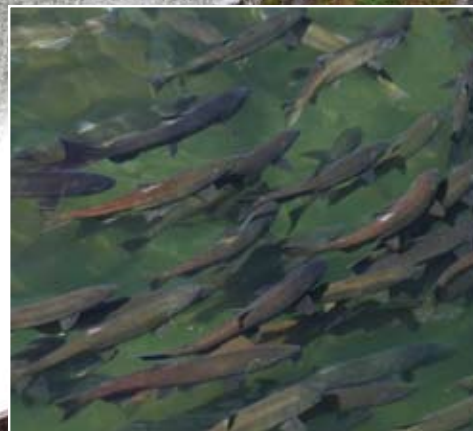
Dam removal will open the river for salmon.

Removal of Condit Dam will allow salmon and steelhead to access river habitat that has been blocked for nearly a century.