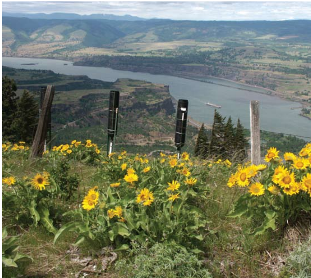
Air quality monitors on the fence at Seven Mile Hill measure pollution levels in the eastern Gorge, which in fall and winter are significantly increased by emissions from PGE’s Boardman plant.

This past September, PGE released its draft plan for future power production, called an Integrated Resource Plan. Under the draft plan, PGE actually plans to increase its dependence on the coal-fired Boardman plant, proposing to spend $560 million to make upgrades that would somewhat reduce sulfur dioxide and nitrogen oxide emissions, but would not decrease carbon dioxide emissions and would still violate the Clean Air Act. But nothing will be done to decrease carbon dioxide emissions and the plant will still