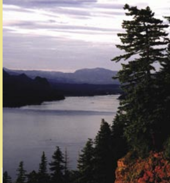
Looking upriver