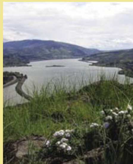
The Labyrinth: ©Angie Moore

Spectacular view point purchase: The newly formed Friends of the Columbia Gorge Land Trust began its first land