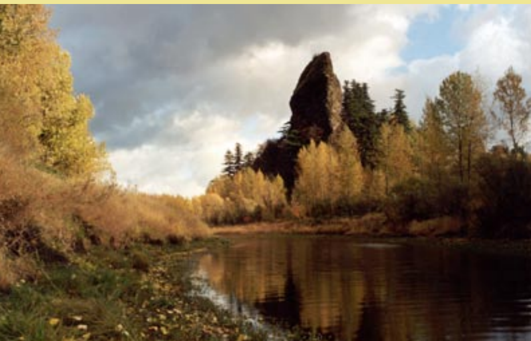
Rooster Rock in autumn

Land inquiries welcome: Several landowners have contacted the Trust in recent months to inquire about selling or donating their property. We welcome inquiries regarding property both inside and outside the Gorge.