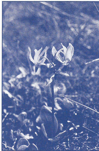
Dodecatheon, Shooting Star