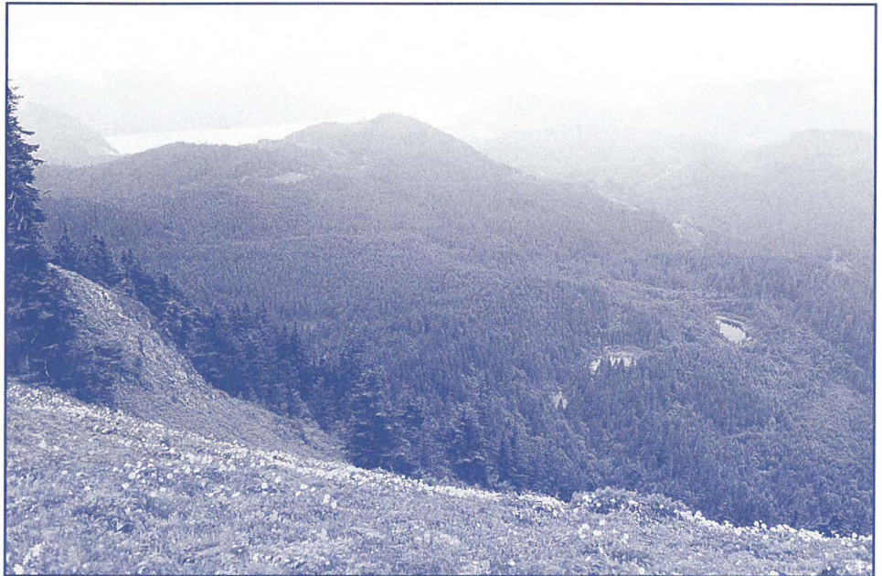
From the slopes of Augsburger Mountain hikers can view Larson Lakes and the Columbia River. The Friends may be forced to file a lawsuit to stop a proposed 142-acre clearcut in the Larson Lakes area.

Unfortunately, in the four years since adoption of forest protection guidelines in the Gorge Management Plan, the states and the Gorge Commission have failed to enforce these guidelines. Oregon and Washington's forestry agencies claim they lack the authority to implement the Scenic Area forest protection guidelines. The Gorge Management Plan provides that if the states fail to regulate timber harvest in "special management" forest lands, "the Gorge Commission shall assume this regulatory responsibility." The states and the