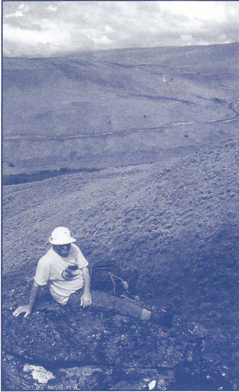
▲ Hiker takes a "rock break" at Ferry Springs on the Deschutes River Trail in April.

Recent sights from our Columbia Gorge Hikes