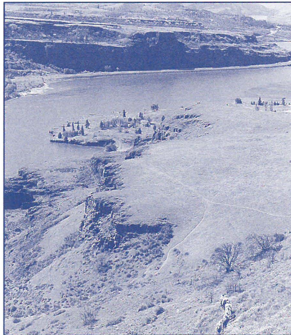
The Lyle Cherry Orchard hike offers a series of sweeping views across the Columbia River to the Rowena Plateau.