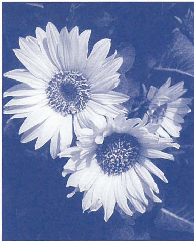
◀ Balsam Root