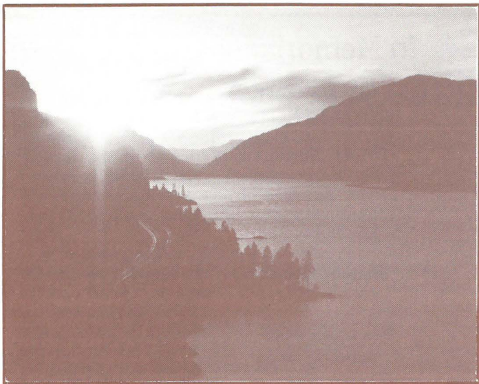
Gorge Sunset, photographed by Craig Tuttle for the 1988 Columbia Gorge calendar, now on sale at Friends of the Columbia Gorge.