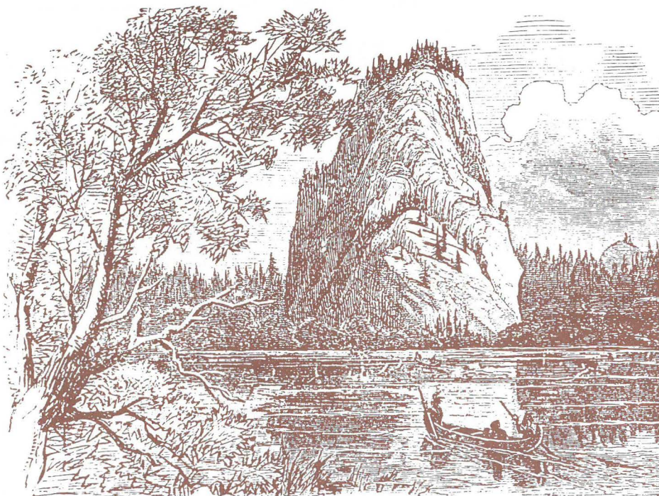
Engraving from The River of the West, Life and Adventure in the Rocky Mountains and Oregon , by Mrs. Frances Fuller Victor, 1870.