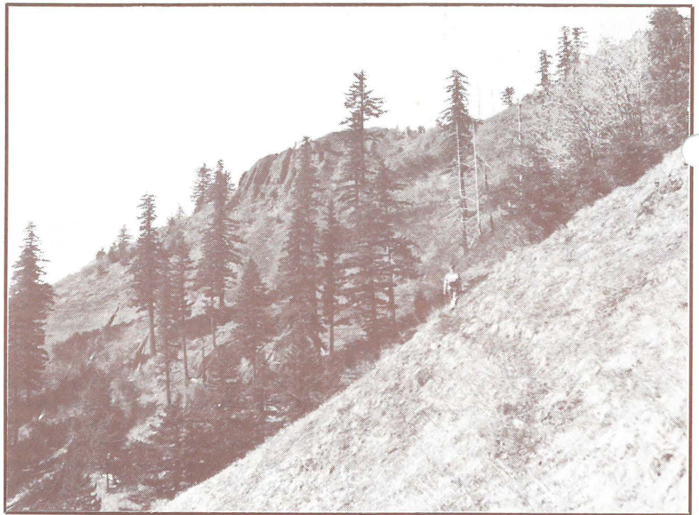
Ruckel Creek Trail, March 30, 1930.