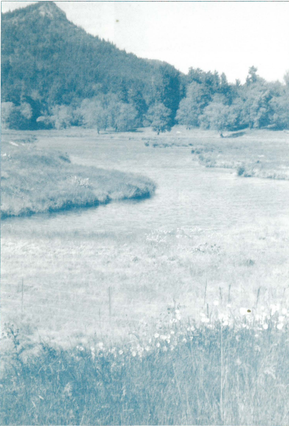
Pierce Ranch, now owned and managed by The Nature Conservancy.

The critical need is to find a funding mechanism to purchase the General Management Area lands that can be securely protected only through acquisition. Some of the options Friends of the Columbia Gorge is studying include the potential for government funding for land purchases in the GMAs, and the feasibility of a private, nonprofit land trust for the Gorge.