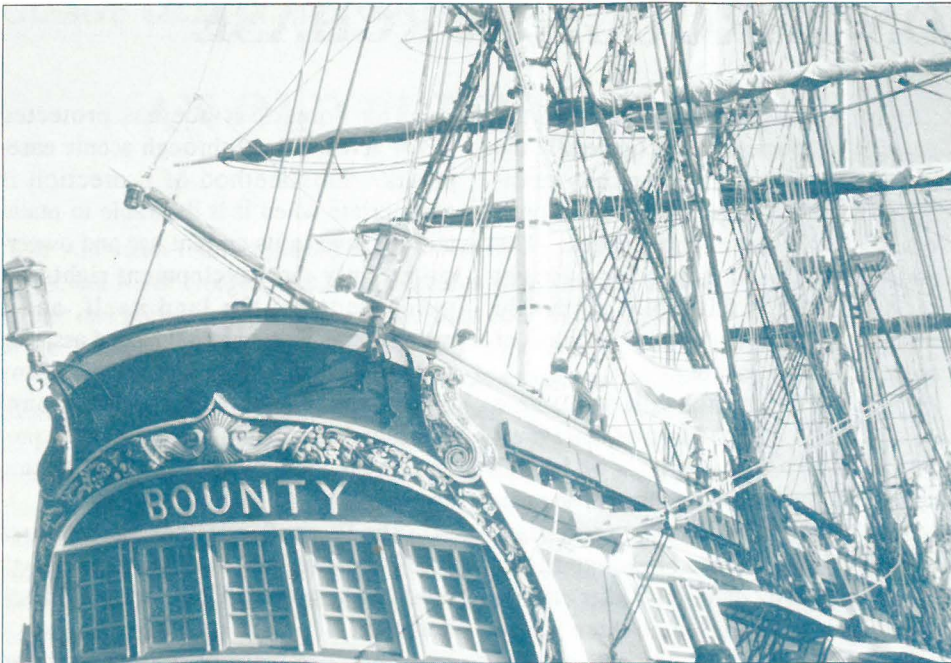
The HMS Bounty benefited Friends of the Columbia Gorge during its stay in Portland.