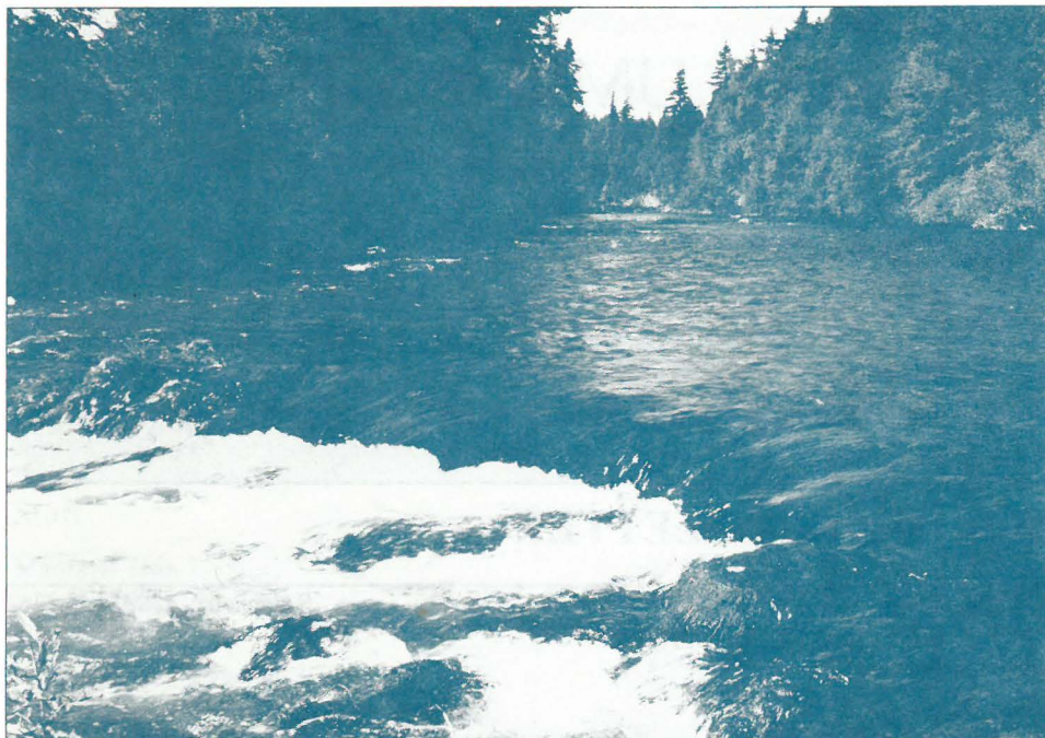
The beautiful White Salmon River faces a decision this year that will determine its future.