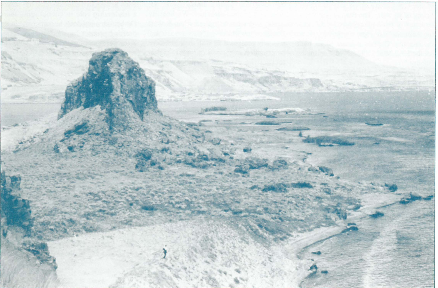
Miller Island, the largest island in the Gorge, is now in public ownership, thanks to acquisition efforts by the Trust for Public Land and the U.S. Forest Service.