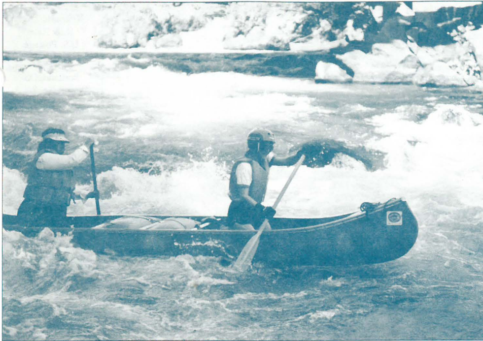
White-water canoeing on the White Salmon River.