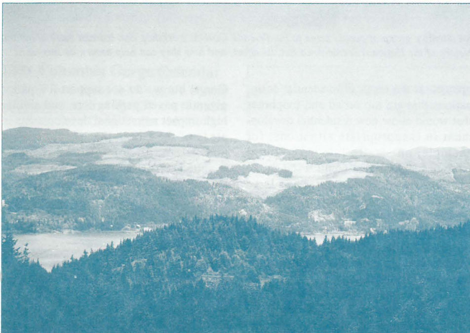
Clear-cuts like this mar the scenic beauty of the Gorge and destroy wildlife habitat.

We do, however, have serious concerns about some of the draft provisions. One of the worst provisions would allow clear-cutting on private lands in the SMAs. It is hard enough to stand by and watch forested slopes in the GMAs sheared by aggressive clear-cutting. As a concession to the timber industry, Congress exempted the forest lands in the GMAs from any new restrictions on timber management and harvest practices under the Act. But Congress specifically provided that the SMAs, the most environmentally and scenically sensitive lands in the Gorge, would be given a higher level