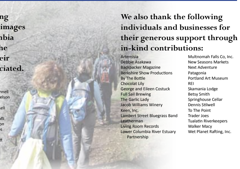
Hikers.