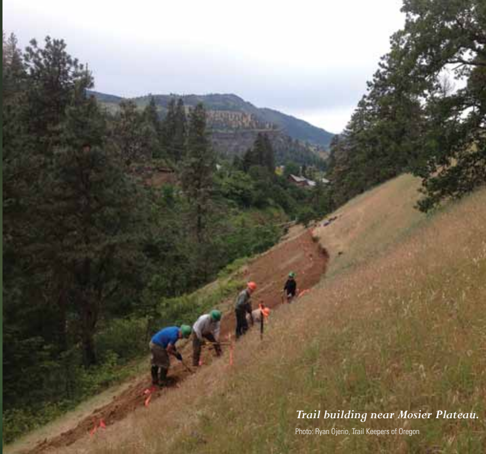
Trail building near Mosier Plateau.