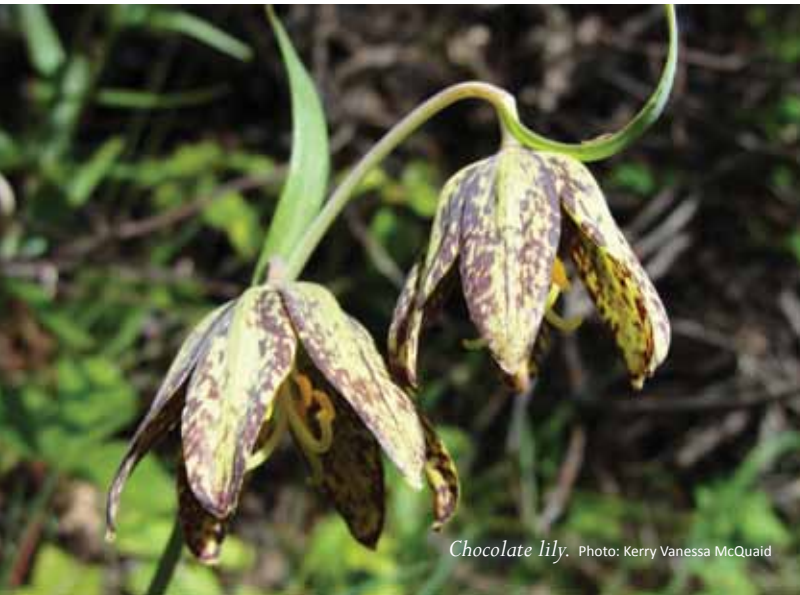
Chocolate lily.